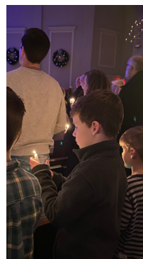
Pictured: Children singing in the December service; Emmanuel: A Christmas Experience with live nativity, crafts, and dinner; and the Christmas Eve Candlelight Service with Children's Nativity.