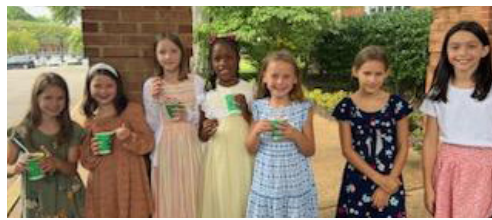
Pictured: FEC Kids Promotion Sunday.