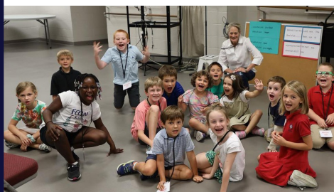
Pictured: FEC Kids Midweek

Memory Verse: “He was despised and rejected by men; a man of sorrows, and acquainted with much grief, and as one from whom men hide their faces he was despised, and we esteemed him not” Isaiah 53:3