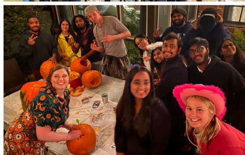
Pictured top to bottom: Break Camping Trip and Candy & Costumes Party.